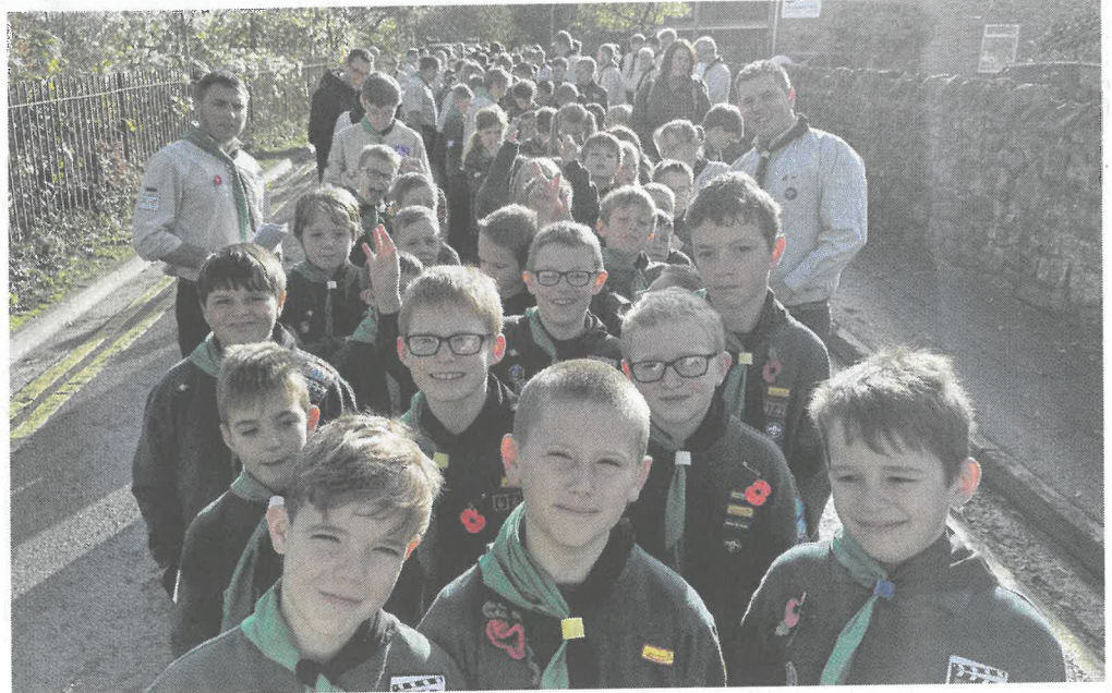
Keynsham Scouts line up for the Remembrance Parade; three of the silhouettes honouring lost Scouts, left

For 100 years Scouts have been present at the Keynsham Royal British Legion's Remembrance Day parade. This year we witnessed the largest turnout ever when more than 200 Beavers, Cubs, Scouts and Explorers joined the procession – what a way to mark the centenary. There were so many that when the parade formed, the line stretched from Station Road to the Memorial Park down the side of the church.