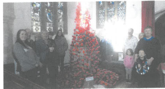
Some villagers from Compton Dando gathered around the poppy cascade made by several women from the village