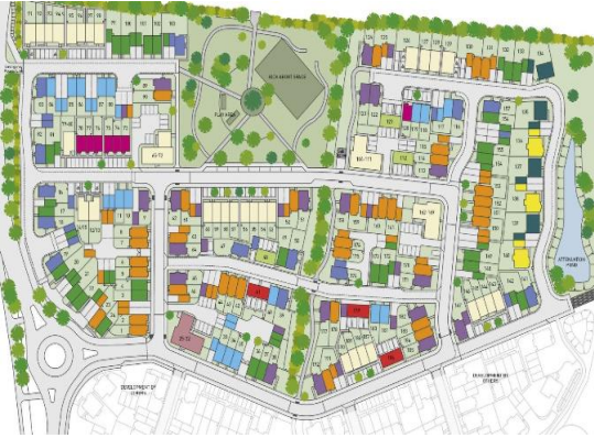
Site layout plan