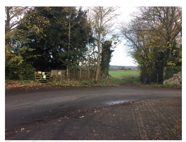
Fig. 1: Point A

Application Route A and Application Route B are hereafter referred to collectively as "the Application Routes."