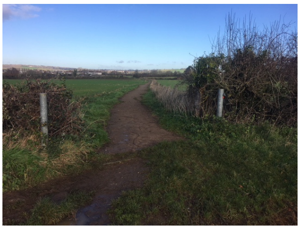
Fig. 4: Point E looking north