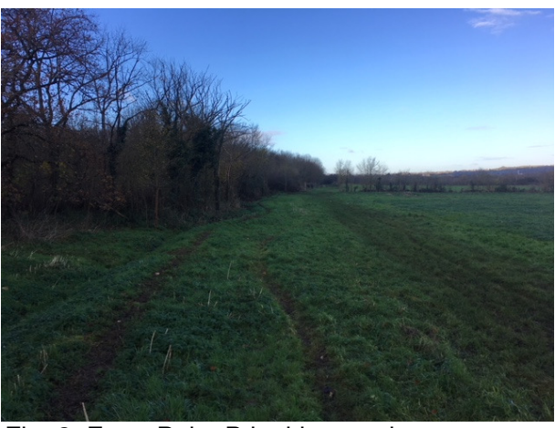
Fig. 2: From Point B looking northwest