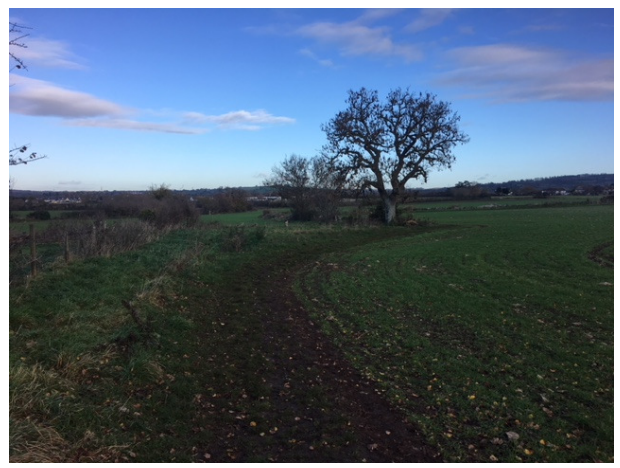
Fig. 3: Between points B and D