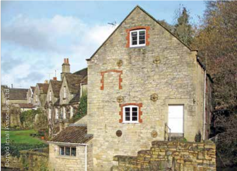
Donald Insall Associates Ltd 2012