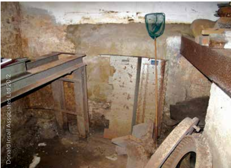
Donald Insall Associates Ltd 2012