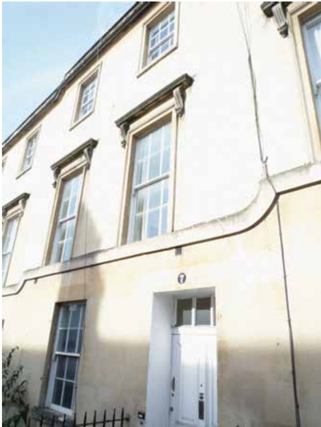
E) Refurbishment and extension of a Grade II listed building incorporating energy conservation measures (7 Charlotte Street; view application)