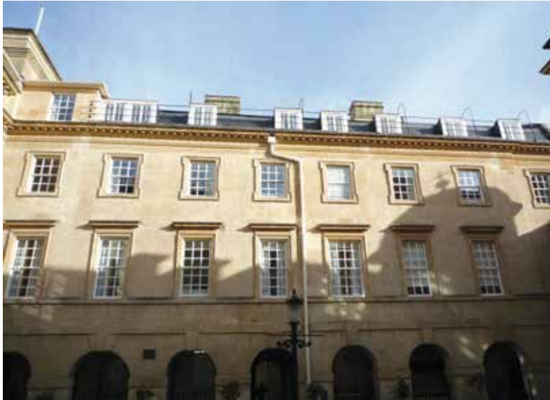
A) New slim-profile double-glazed windows in Grade I listed building (St John's Hospital, Bath City Centre; view application)

The following case studies provide examples of detailed applications for Listed Building Consent, demonstrating good practice both in the level of detail provided and in the initial consideration of measures. You will see that not all of the proposed measures were well received; however these also provide useful case studies for potential applicants. Please note that all planning and listed building applications are available for public viewing online .