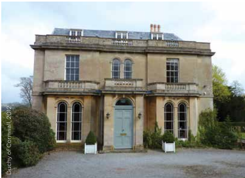
Duchy of Cornwall, 2012