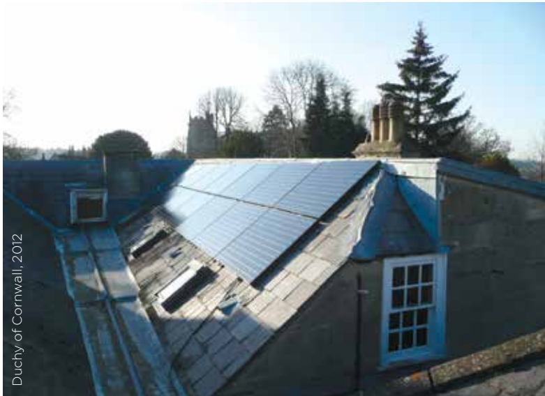
Duchy of Cornwall, 2012