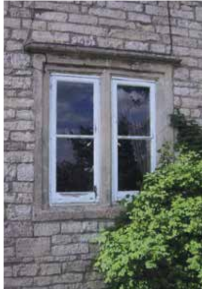
B) New slim-profile double-glazed units in Grade II listed building (Tunley Farmhouse, Tunley Hill, Camerton; view application)