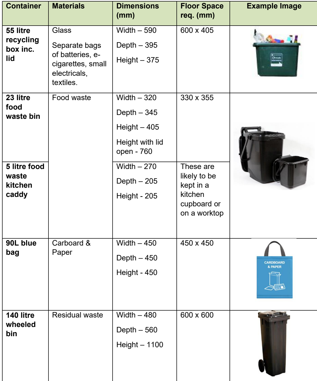
Table 5: Standard Kerbside Container Dimensions