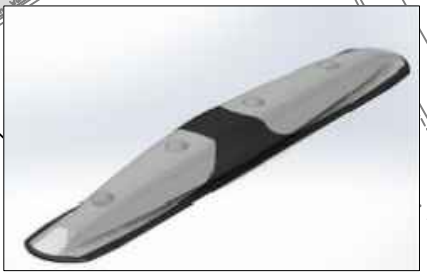
DETAIL 3: CYCLE LANE SEPARATOR 120mm WIDE x 720mm LONG (TYPICAL ARRANGEMENT)