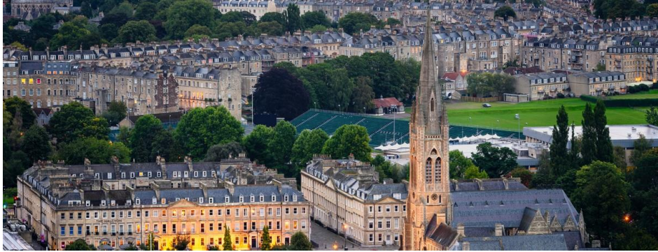
Pictured: Wide shot of the city of Bath

The Future Ambition Board was established in 2021 to lead on action planning for a fairer, greener, more creative, and connected Bath City Region. The Climate and Nature sub group of the partnership is led by a business representative and includes 15 reps from public, private and community sectors in B&NES, across a range of subject areas.