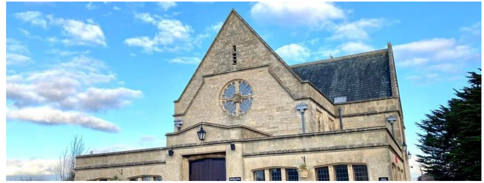
Pictured: The top Chapel at Haycombe Cemetery.

Managed by the council, Haycombe Cemetery has made efforts to support biodiversity and nature on site. Following a surprise inspection, they received a 95% score for environmental awareness (22% above industry average). The score reflects the cemetery's commitment to sustainability demonstrated across the site.