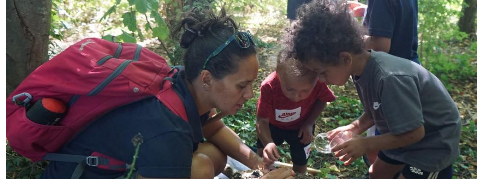
Pictured: A Bathscape volunteer runs an engagement session with two children

The council-led Bathscape Landscape Partnership Scheme has continued to deliver nature, heritage, equal access, health and education outcomes. Three new areas of wildflower meadow have been sown, habitat management practical volunteer days run weekly, and a programme of outdoor wildlife, walking and training events have attracted over 2000 local residents. In addition, the sixth Bathscape Walking Festival took place in September, with over 1400 people joining one or more of the 60+ walks, supported by more than 30 volunteers giving over 350 hours of their time.