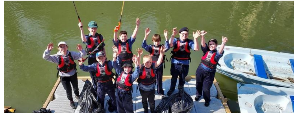
Pictured: Nine Bath Sea Cadets at the Great Avon River Pick on a floating barge with their hands raised in the air.

More than 120 bags of litter were collected from the banks of the River Avon in Bath and North East Somerset by volunteers and local organisations as part of the Great British Spring Clean 2022. One hundred and seventy people of all ages came together to clear the litter using equipment provided by Bath & North East Somerset Council including 70 litter pickers, 30 children's pickers, sacks, gloves and high vis jackets.