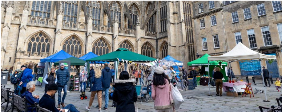
Pictured: Community day event with Bath Abbey in the background, in the foreground there are people walking and browsing several gazebos.

In September 2022 the council ran its second Climate and Biodiversity festival which saw over 500 people take part in 50+ events relating to climate and nature over the Great Big Green Week. Most events were community led and supported already active climate groups in promoting local projects including a 'community day' event which ran outside Bath Abbey. Stalls were set up in the square next to the Abbey where visitors to the city of Bath could take part in climate themed activities and discussions with stall holders.