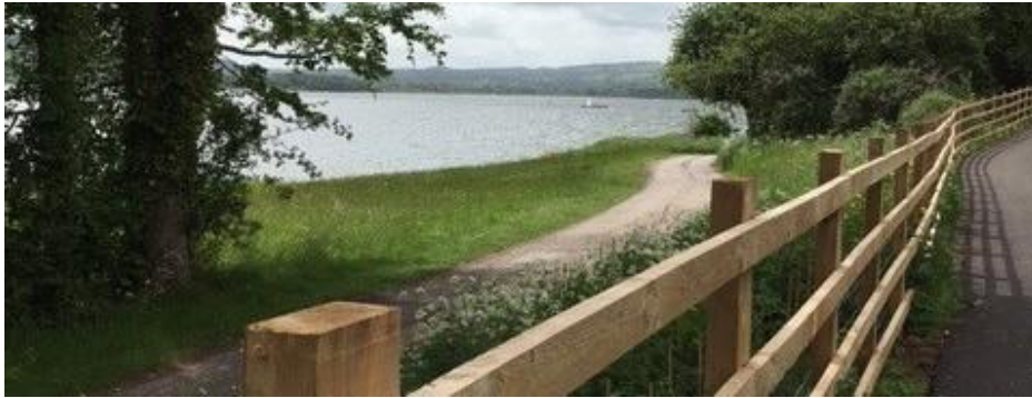
Pictured: Northern section of the Chew Valley Lake Recreational Trail

The northern section of the Chew Valley Lake Recreational Trail opened in May 2022. The project was part funded and led by B&NES working with Bristol Water and West of England Rural Network. B&NES have since secured WECA funding to develop the business case for the southern section and have recruited a Project Manager to lead on this and develop the wider Chew Valley Reconnected project.