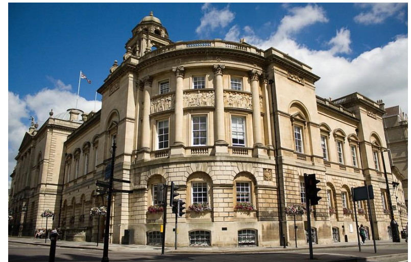
Pictured: The Guildhall on a sunny day in Bath