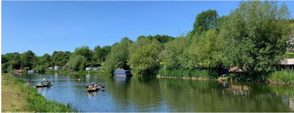
Pictured: People using paddleboards on the river in Saltford.

The WaterSpace programme aims to revitalise the waterways through B&NES. In Bath, the team have secured funding to deliver the first phase of the Bath River Line, a 10km greenway through the heart of the city. We have also joined up with South Gloucestershire Council and Bristol City Council to extend the project across the region, through the WaterSpace Connected project.