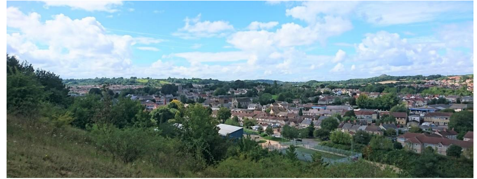
Pictured: A birds eye view of Somer Valley.

The Environment Act will require all developments to deliver a minimum 10% 'net gain in biodiversity' from November 2023, which means that development must leave nature in a better state than before.