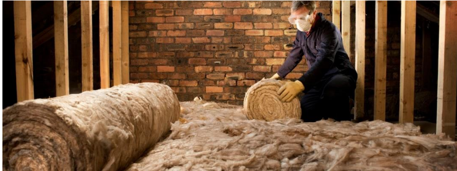
Pictured: A contractor installing loft insulation.

The affordable warmth grant uses money from several funding pots including; Council affordable warmth scheme, Government Green Homes Grant - Local Authority Delivery scheme (LAD) and Government Sustainable Warmth scheme – Home upgrade Grant (HUG), and has enabled community members with most need to access home energy efficiency improvements.