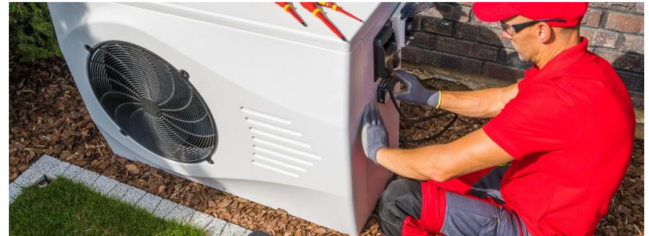
Pictured: A contractor installing a heat pump in a garden.