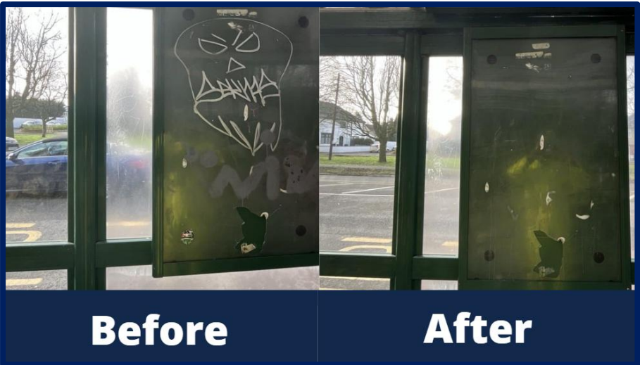
13.02.2026 - Bath Road - Keynsham