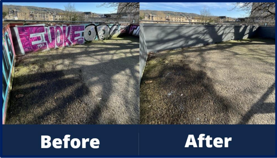
24.02.2026 - Walcot Street - Bath