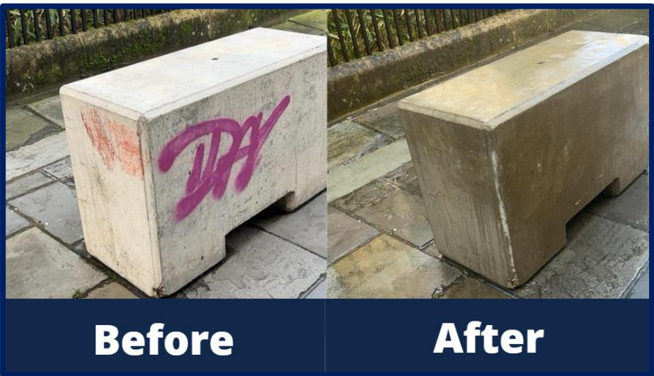
16.02.2026 - Chapel Row - Bath