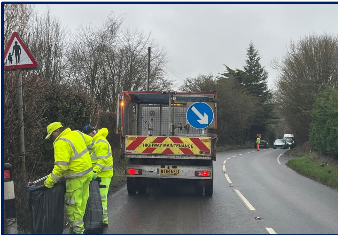
18.02.2026 – Bloomfield Road, Timsbury