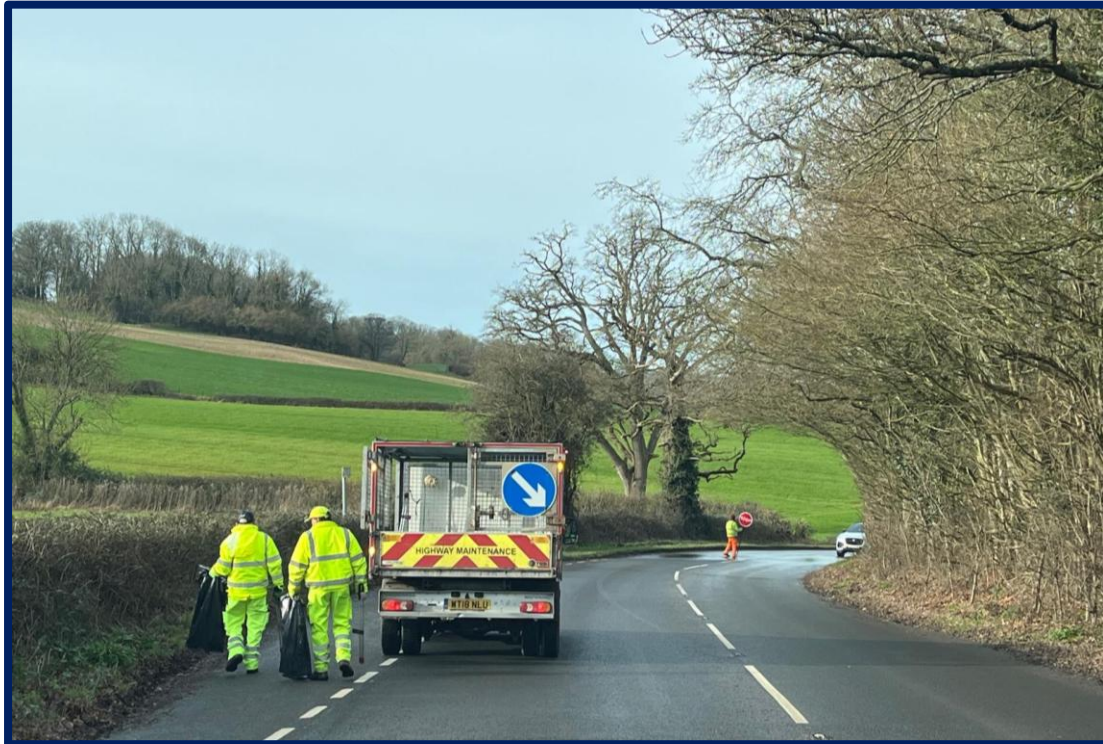
17.02.2026 - Chelwood Roundabout

See below for pictures of our teams' litter picking: