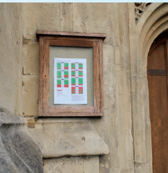
South West door

There are daily services in the Abbey, choir practices and many other events in the year. To help Street Musicians, the Abbey publishes a traffic-light system on two public noticeboards. (On the board facing the Roman Baths, and the board on the railings on the side facing Kingston Parade.) Green means it is ok to proceed with care; the red means please do not busk.