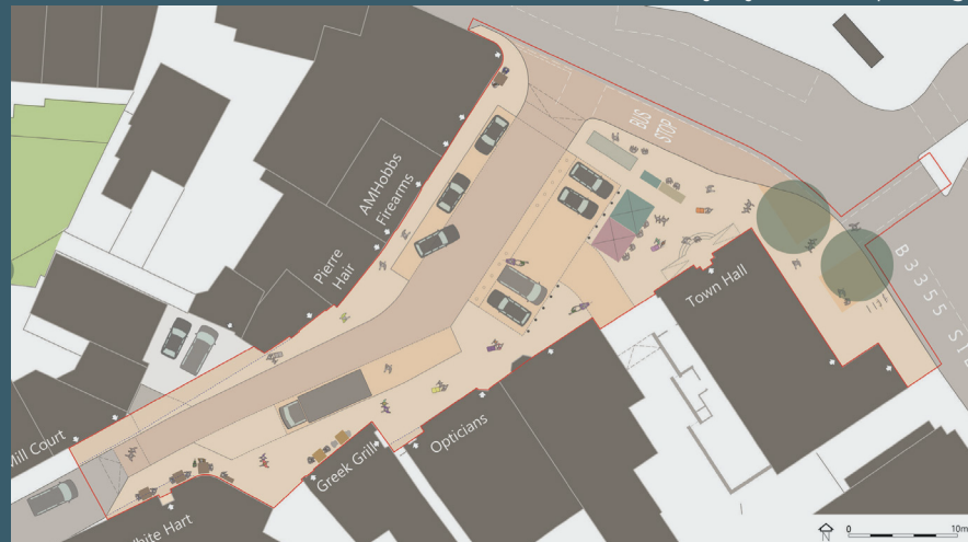
'Everyday' use with parking and loading