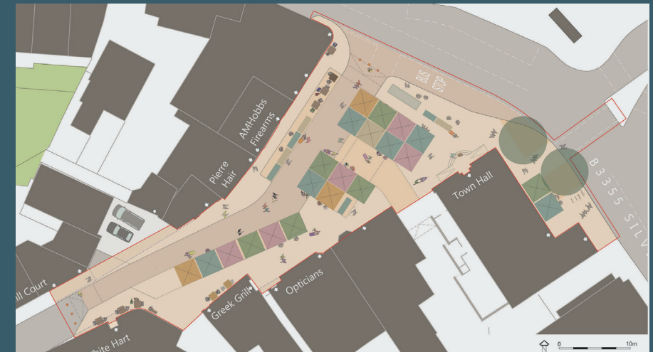
Medium event use