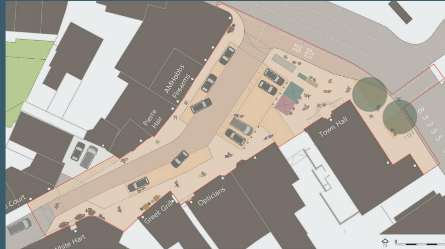
'Everyday' use with parking

Early concept designs were developed by Nicholas Pearson Associates, which illustrate the different ways the space could be used.