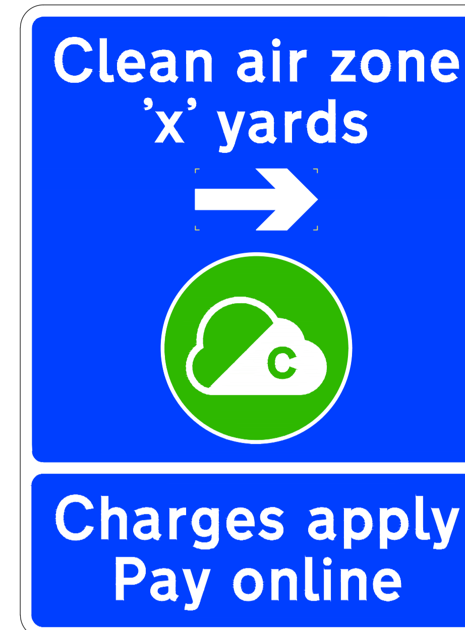
Refer to advanced ahead warning sign locations (yards distance varies)