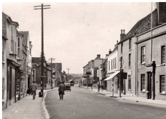
Upper High Street circa 1950