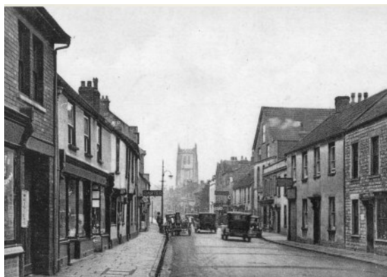
High Street circa 1930