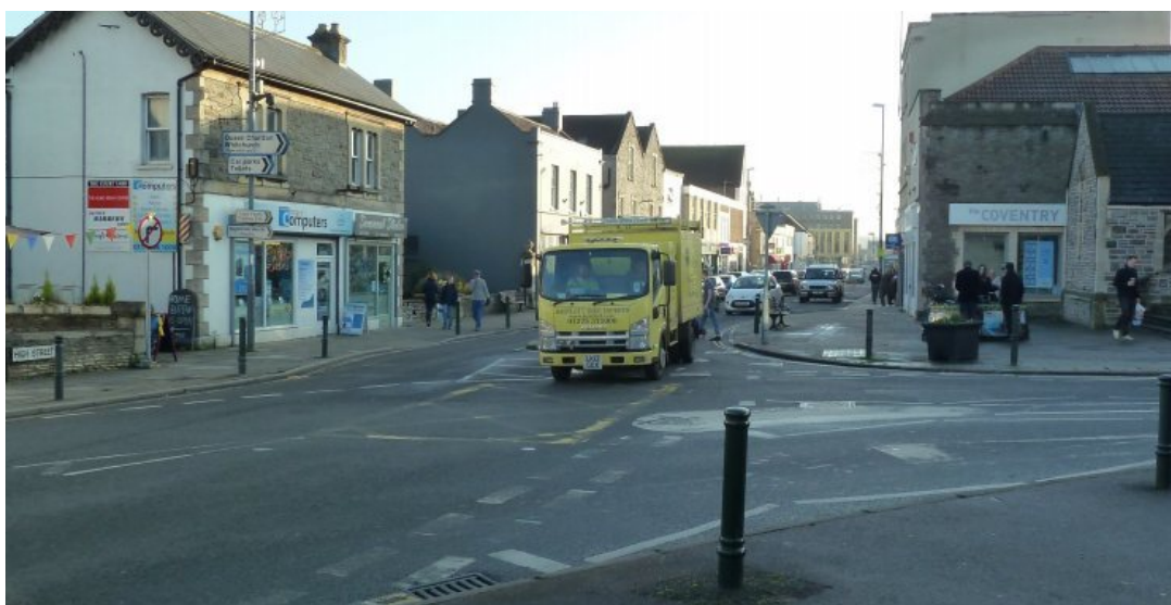
Road junction of Upper and Lower High Street