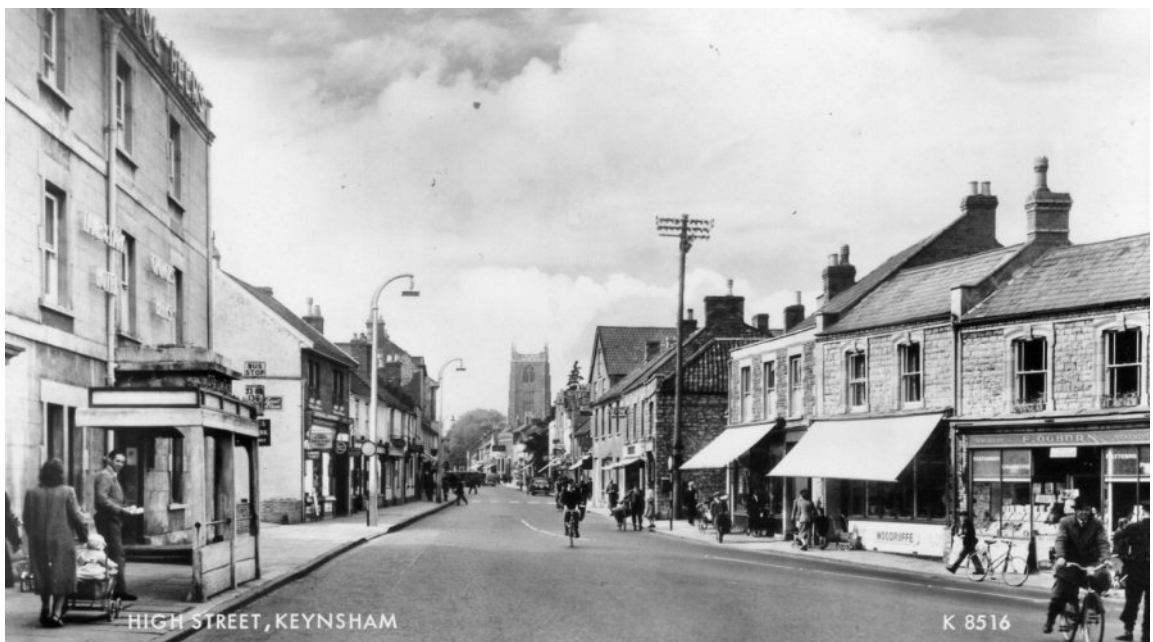
Lower High Street circa 1950