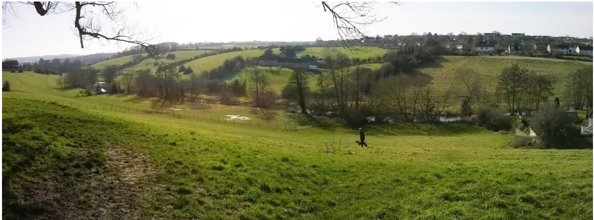
Wide open countryside at the south of Keynsham should be retained