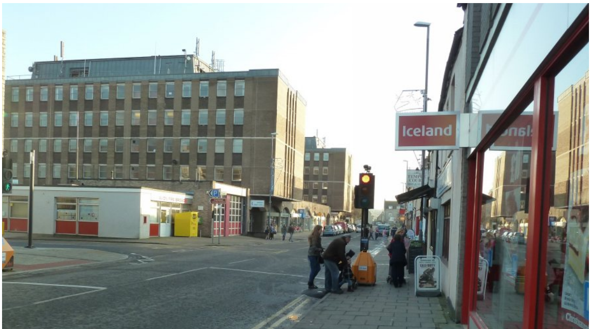
The existing 1970 Temple Street and Fire Station (on left foreground) which should be redeveloped in the near future