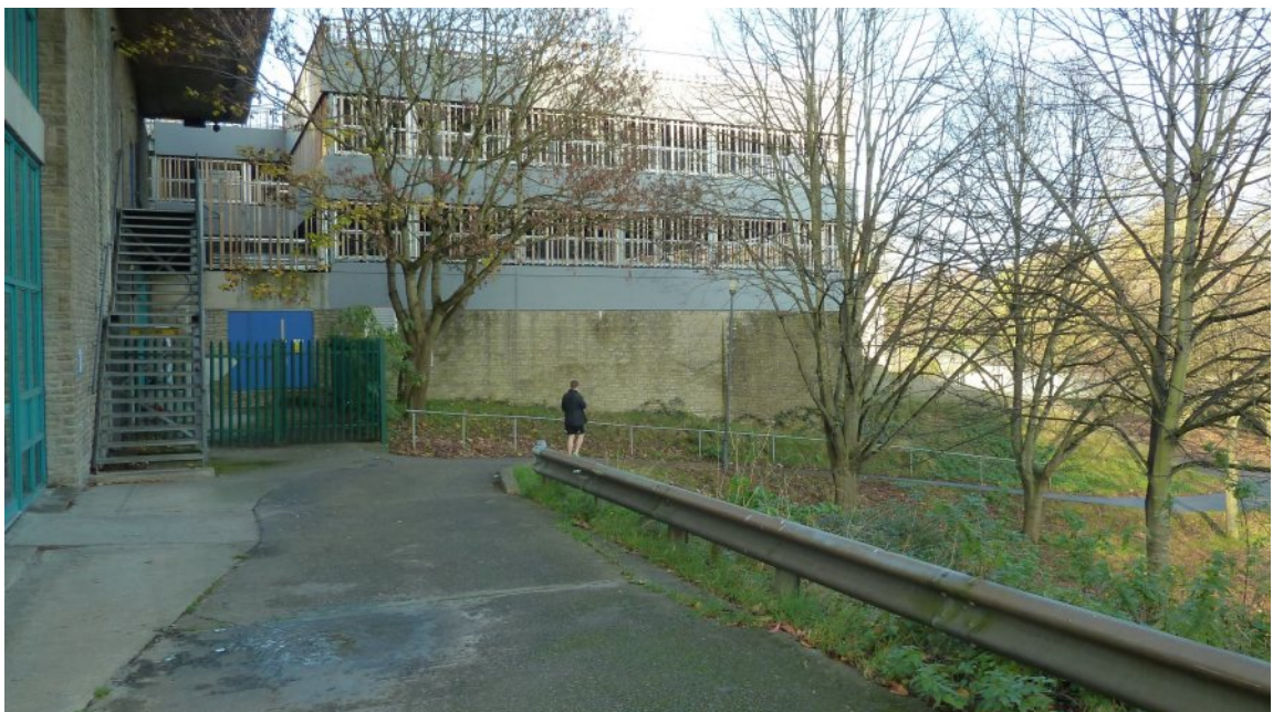
Existing inhospitable pedestrian stairs routes from park into Temple Street need to be improved as re-development occurs