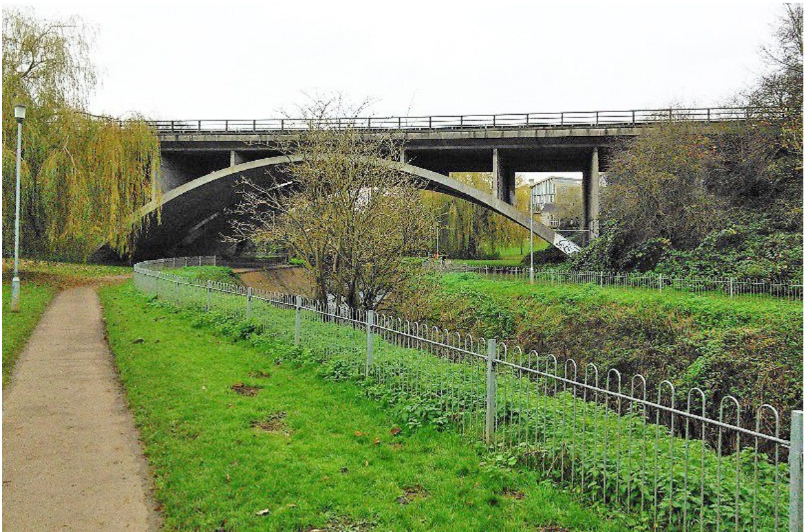
Replacing utilitarian railings with improved designs and additional planting would enhance this view.