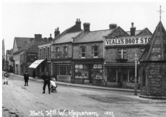
Bath Hill 1897

© The contents of this document are copyright protected