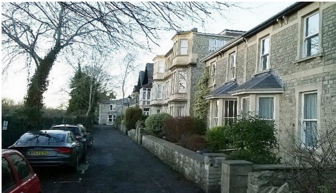
Attractive railway houses dating from the 1840's. Walls and front elevations should be retained wherever possible.