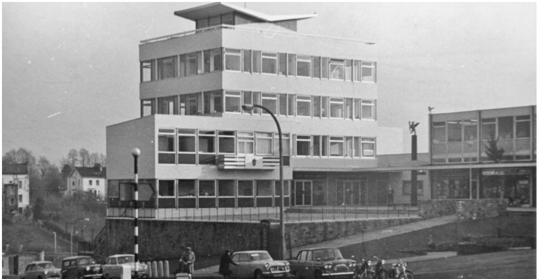
Former Civic Centre 1965 (above) redeveloped in 2014 (below)