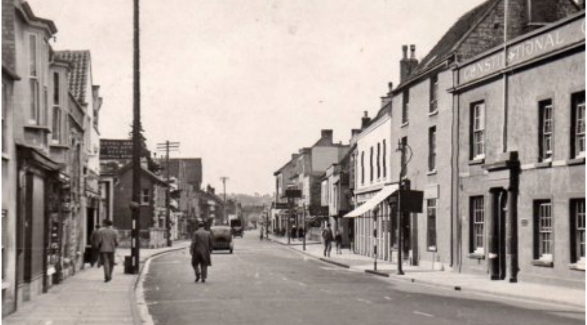
Upper High Street circa 1950

Particular attention is to be given to improving the town's relationship to the river.