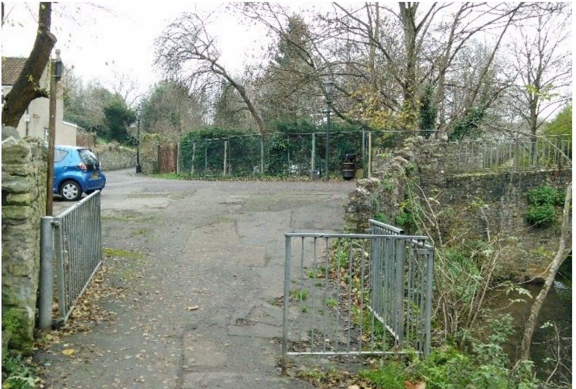
Improvements to this well used historic bridge would improve the character of the area.