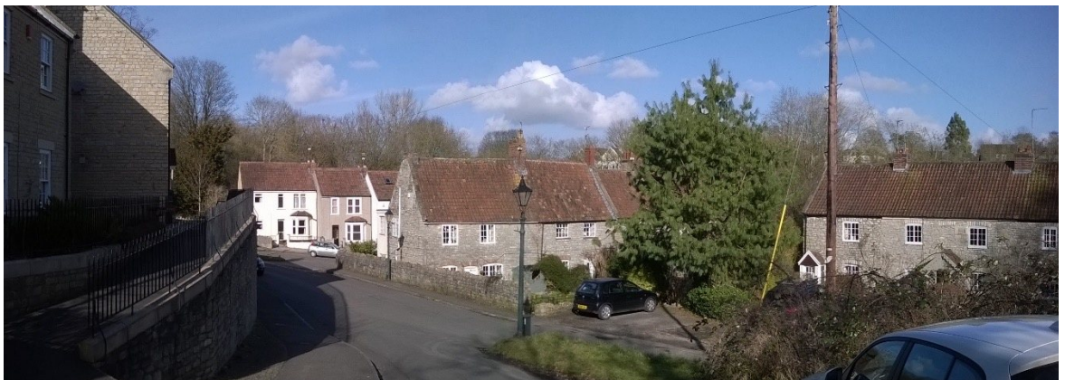
Dapps Hill is an attractive historic part of Keynsham which presents a village character. Although some of the historic details have been lost through changes.