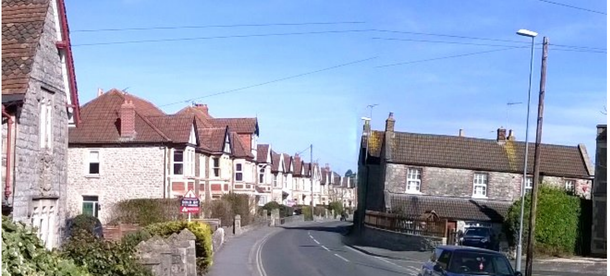
Attractive terrace of 1930's housing and front gardens and walls in Charlton Road