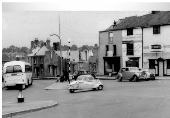
Bath Hill circa 1960 beginning of demolition