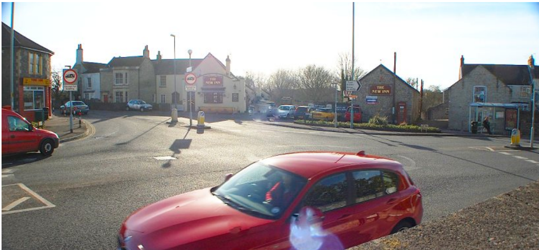
Former market place at Bath Hill/Bath Road now a busy road junction with an expanse of road and traffic signage which could be improved in the future.