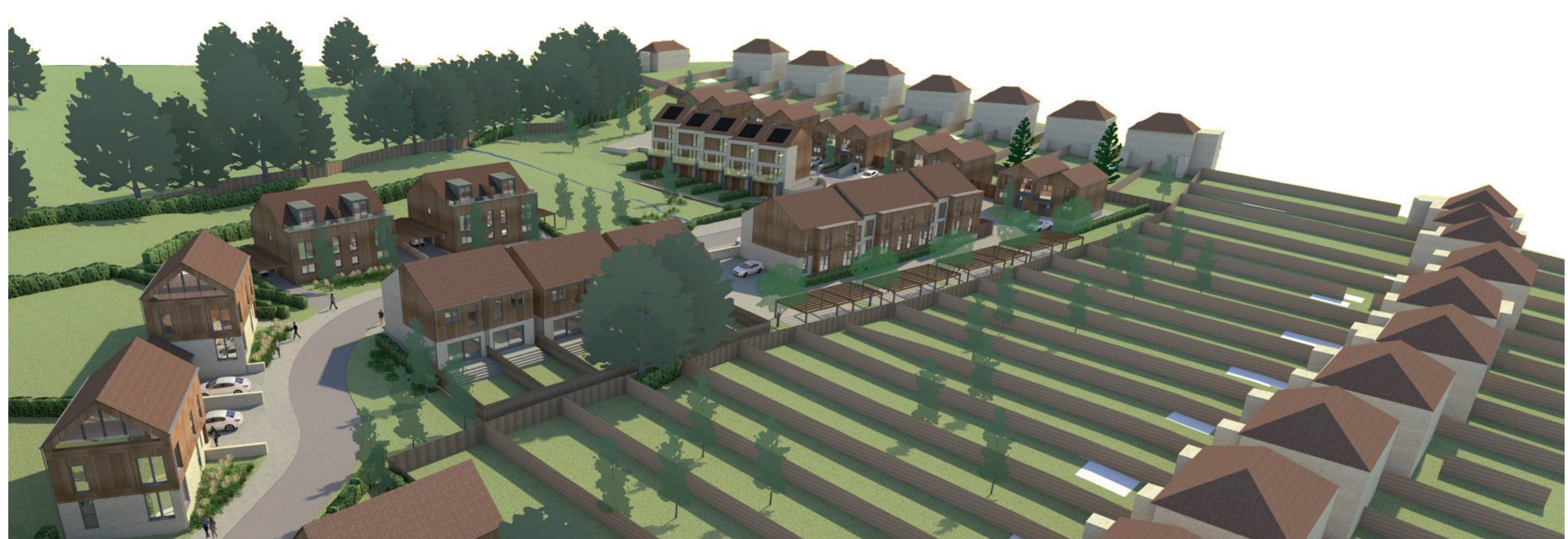
AERIAL VIEW LOOKING SOUTH WEST ACROSS THE SITE