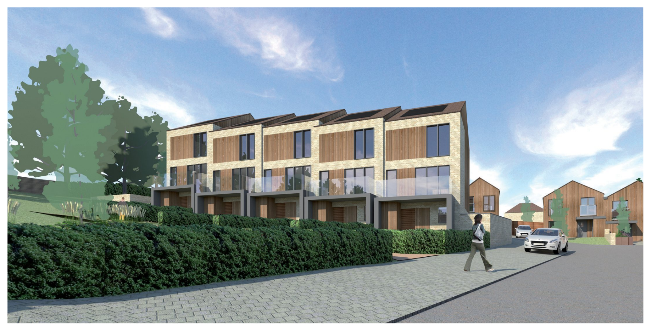
06 - TERRACE FRONTING ONTO THE POCKET PARK