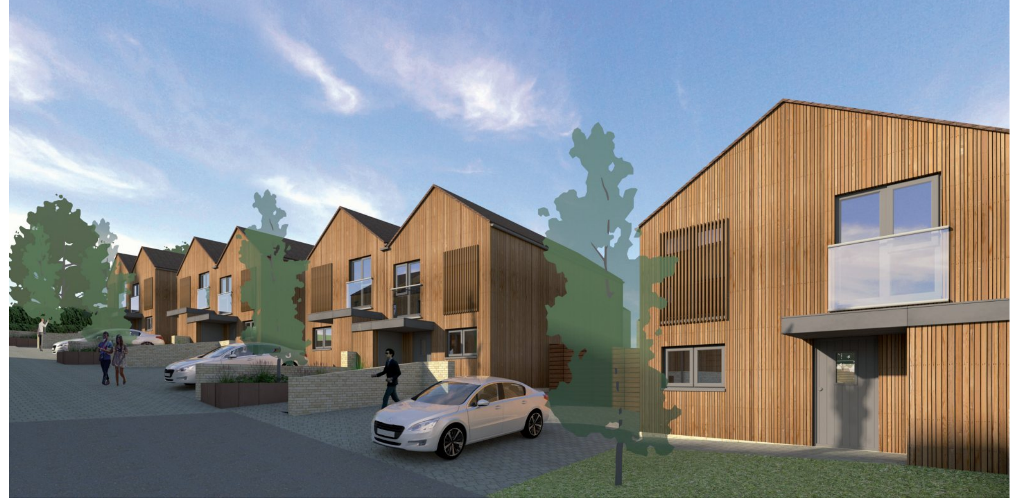
08 - WESTERN BOUNDARY 2 STOREY, 2 AND 3 BEDROOM HOUSES