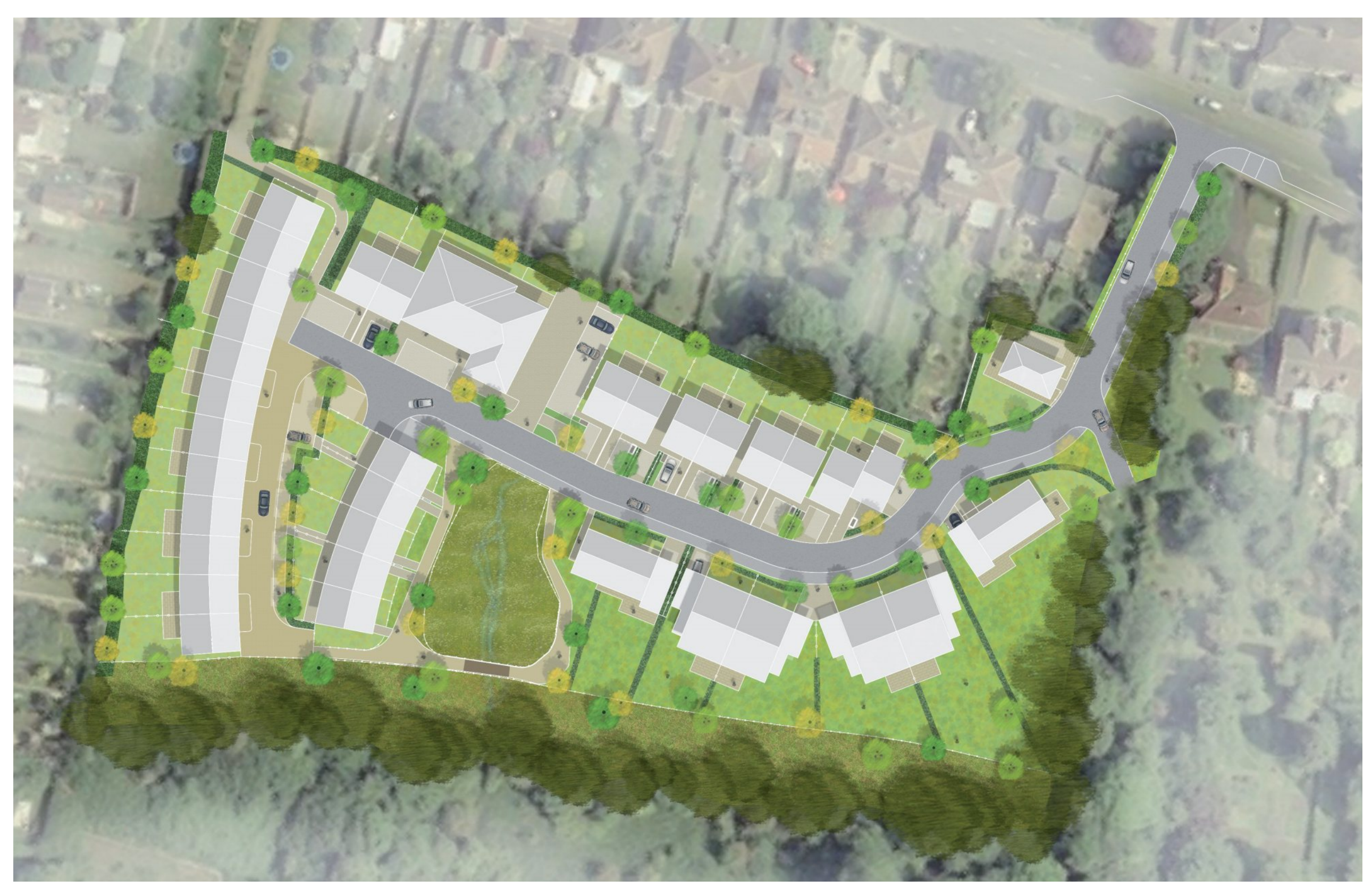
PREVIOUS CONSULTATION SITE PLAN - 12TH JULY 2017