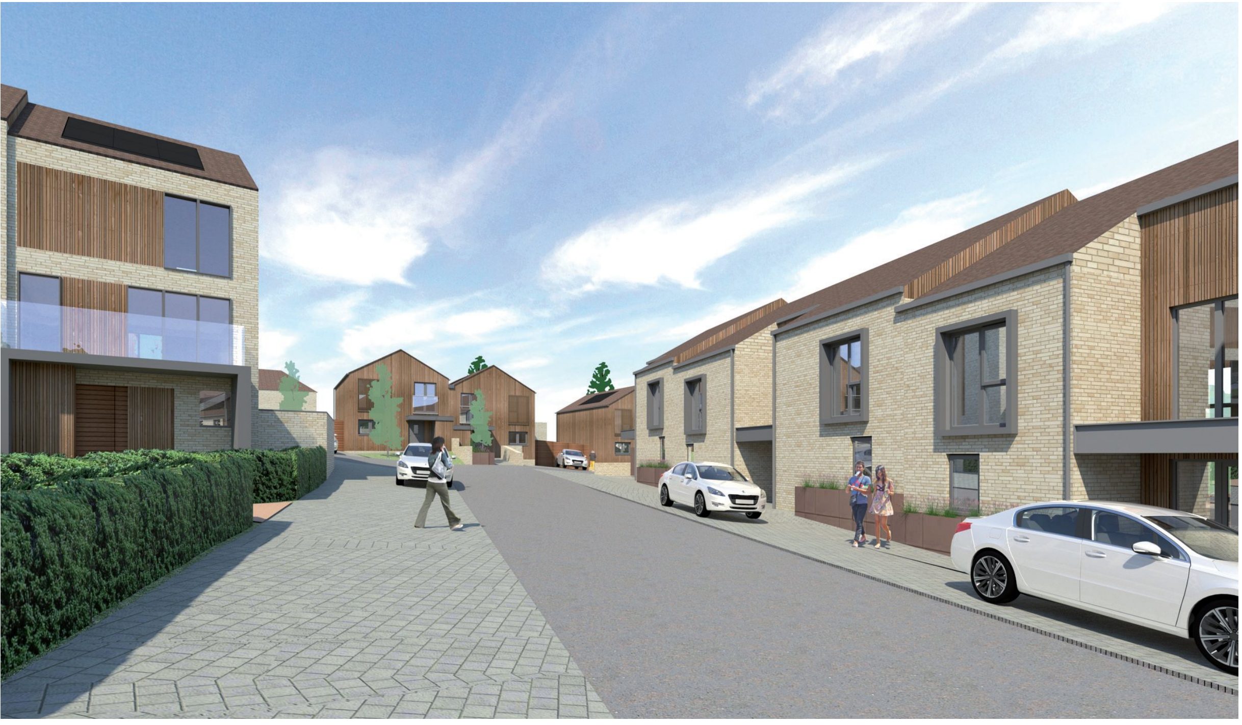
02 - LOOKING WEST FROM WITHIN SITE