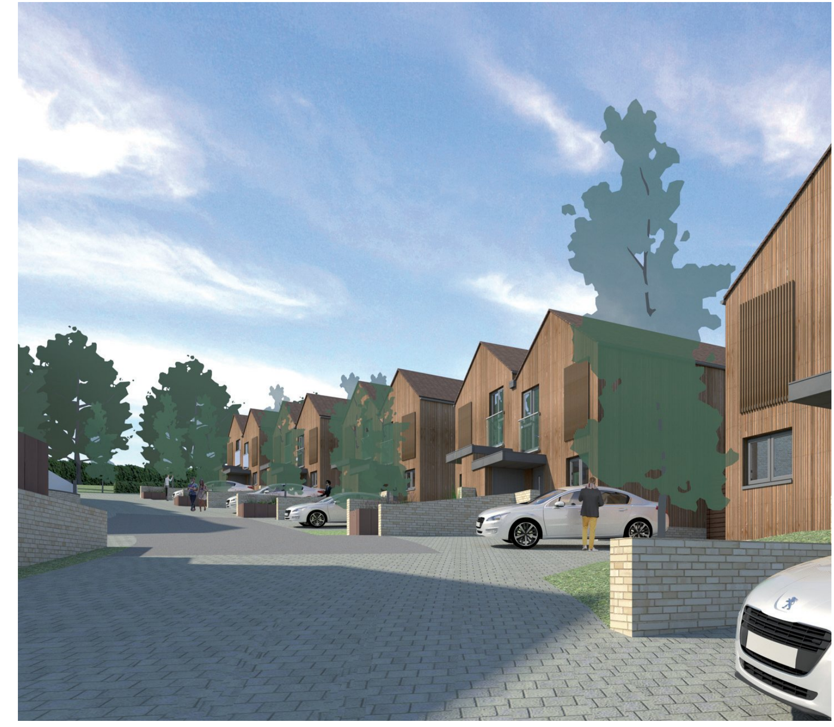
01 - WESTERN BOUNDARY 2 STOREY, 2 AND 3 BEDROOM HOUSES