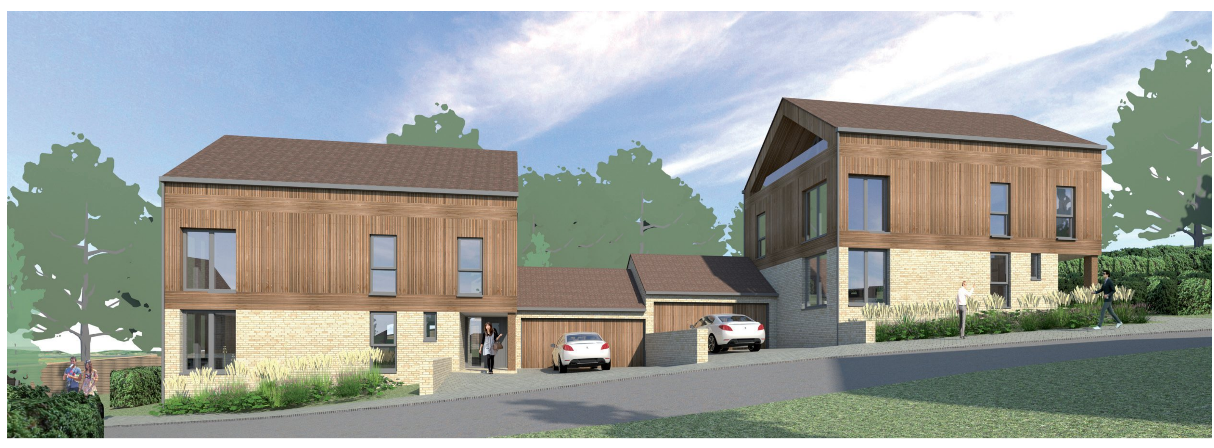
04 - EASTERN BOUNDARY 4 BEDROOM HOUSES