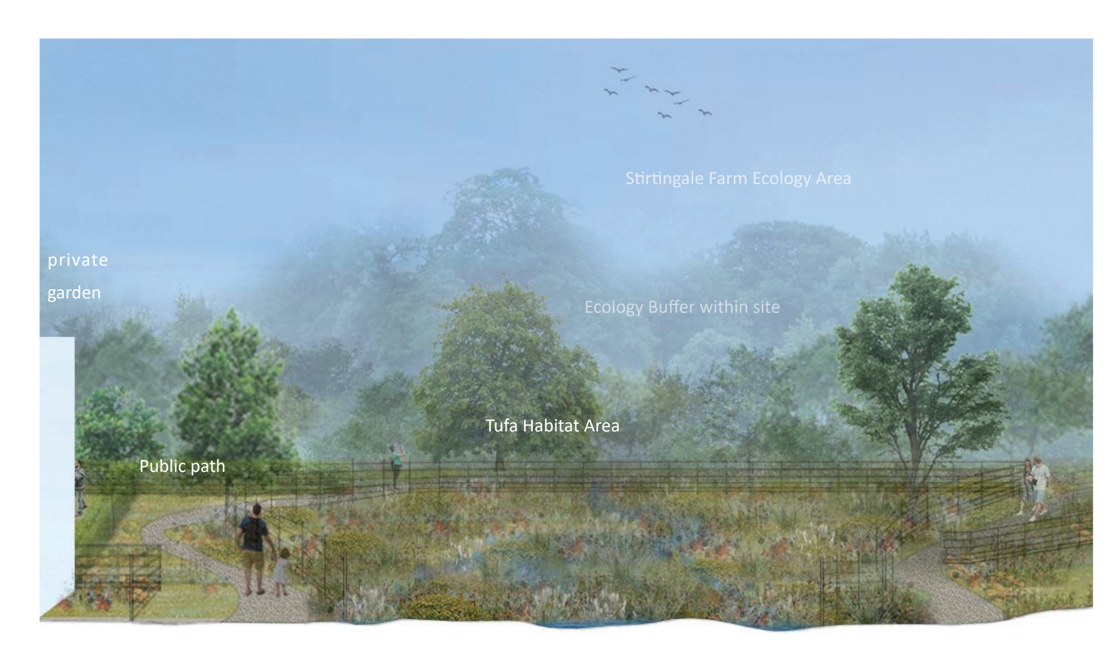
VISUALISATION OF THE TUFA AREA