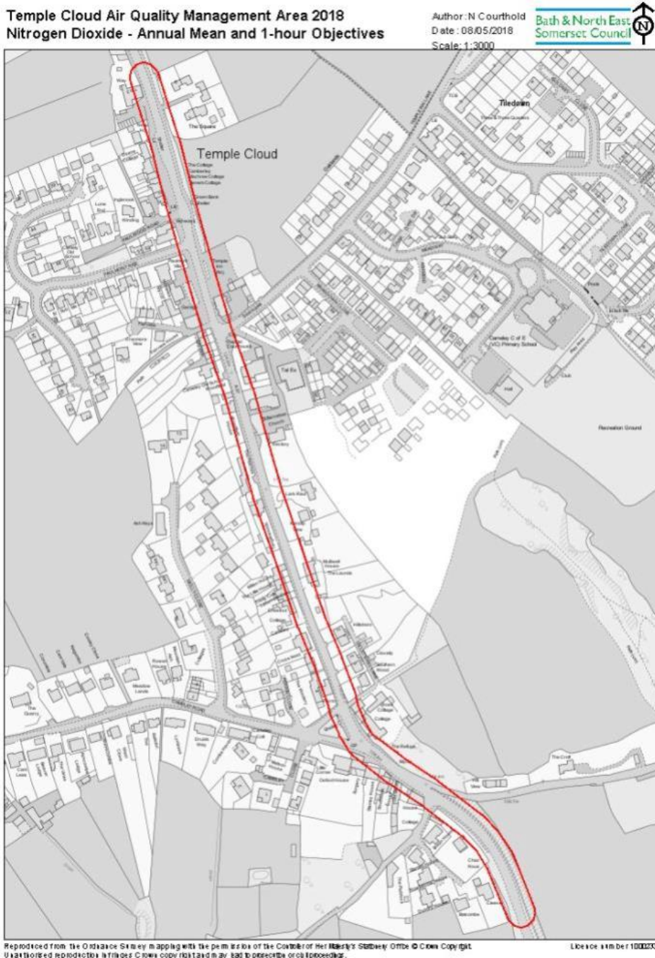
Figure 1.1 Temple Cloud – Air Quality Management Area Boundary

Bath and North East Somerset Council has a statutory obligation under Part IV of the Environment Act 1995 to review and assess air quality within their area. Following a review of the air quality across the authority, areas within the villages of Temple Cloud and Farrington Gurney on the A37 were identified as exceeding the National Air Quality Objectives for Nitrogen Dioxide (NO 2 ) concentrations. As a result, the Council declared Air Quality Management Areas (AQMAs) for the areas of exceedance in these locations. As might be expected, the exceedances occur on the main A37 passing through each settlement. Figure 1.1 and Figure 1.2 show the AQMA extents in each case. Both AQMA areas came into force on the 20 th August 2018.