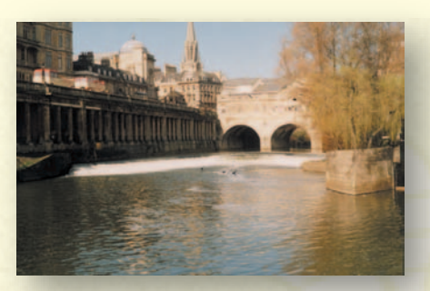
The Weir at Pulteney Bridge

The original weir was in place when there were several mills in the area to provide water power for the cloth trade, which was Bath's chief industry. The present weir of 1971 was designed purely for artistic affect. The flood barrier was built in the 1970's.