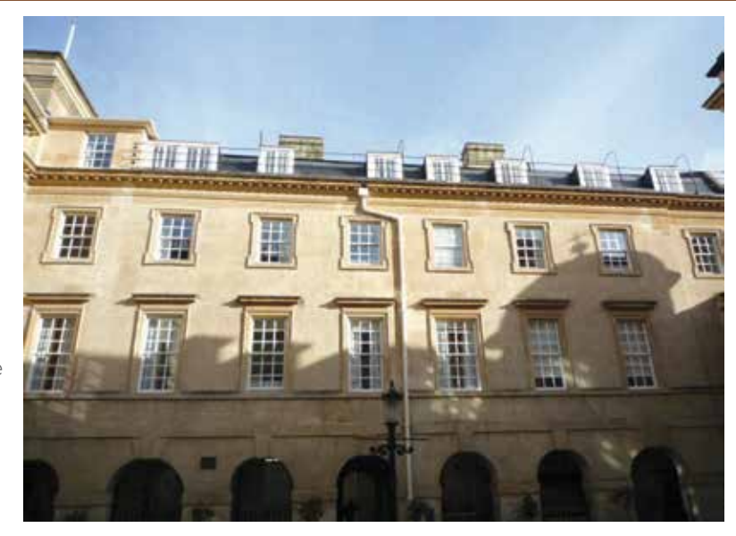
A) New slim-profile double-glazed windows in Grade I listed building (St John's Hospital, Bath City Centre; view application)

The following case studies provide examples of detailed applications for Listed Building Consent, demonstrating good practice both in the level of detail provided and in the initial consideration of measures. You will see that not all of the proposed measures were well received; however these also provide useful case studies for potential applicants. Please note that all planning and listed building applications are available for public viewing online.