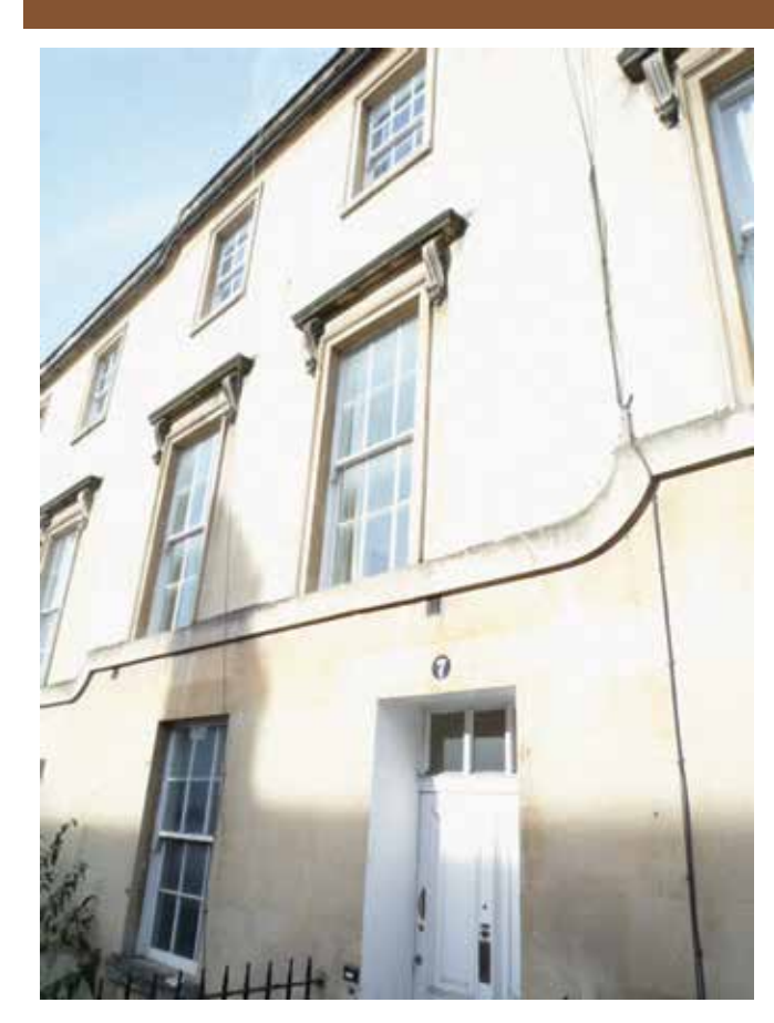
E) Refurbishment and extension of a Grade II listed building incorporating energy conservation measures (7 Charlotte Street; view application)