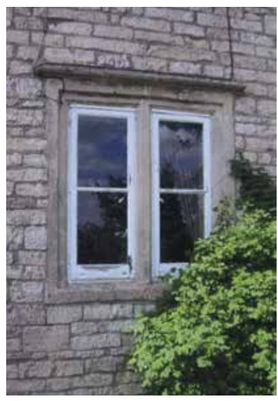
B) New slim-profile double-glazed units in Grade II listed building (Tunley Farmhouse, Tunley Hill, Camerton; view application)