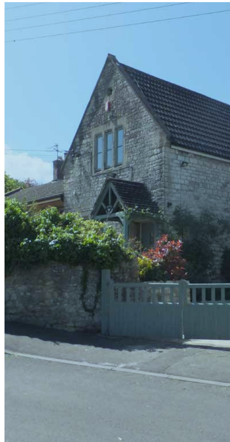
Old School House, Writhlington

The setting of a locally listed asset may include land outside the building's curtilage and could include adjacent land, important views or the wider street scene.