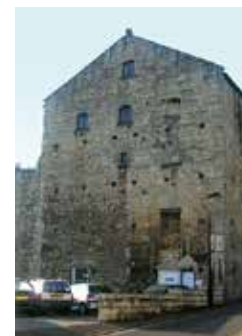
19th Century former Malt House

The Old Mills Batch is a local heritage asset with significance deriving from its evidential, historical and communal value relating to the history of the coal mining industry in Somerset.