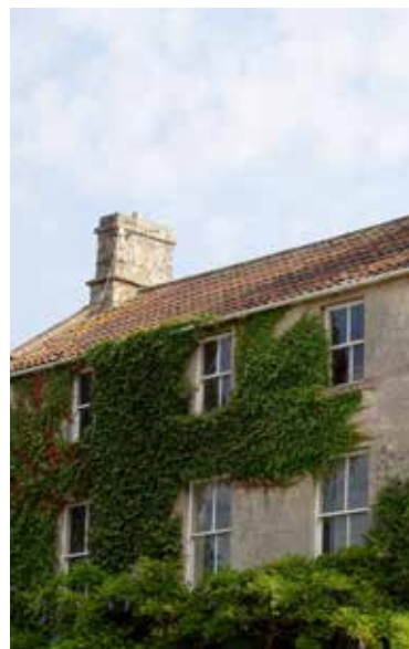
Many attractive historic buildings in the area are not statutory listed.