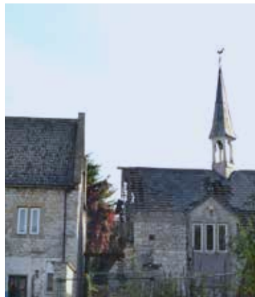
St Nicholas School, Radstock

In cases where permission is granted for the demolition of a locally listed asset, the Council may require that provision is made by the developer to accurately record the asset prior to its demolition. There will be an expectation that the asset is replaced with one that makes a positive contribution to the character of the locality.