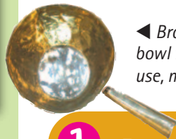
◀ Brass compass bowl for domestic use, made at the Mill

1 From Salford Brass Mill, walk north along 'The Shallows', up the slope to the Bird in Hand pub. At the T-junction, turn right onto Mead Lane then take the steps up on to the Bristol & Bath Railway Path via the Bird in Hand car park.