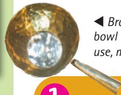
◀ Brass compass bowl for domestic use, made at the Mill

1 From Salford Brass Mill, walk north along 'The Shallows', up the slope to the Bird in Hand pub. At the T-junction, turn right onto Mead Lane then take the steps up on to the Bristol & Bath Railway Path via the Bird in Hand car park.