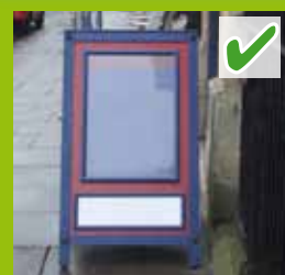
Single sign against property