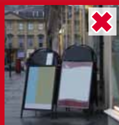
More than one per property