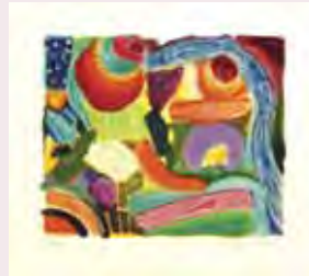
Gillian Ayres - Matuka

Spot signs of spring in our displays and create a spring collage. For 6 to 11 years.