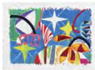
Gillian Ayres - Star Spangled , Print, 2010

Saturday 3 March, 11am - 3pm Join us in Freshford Memorial Hall for a variety of hands-on archaeology activities. Bring along your finds for identification too.