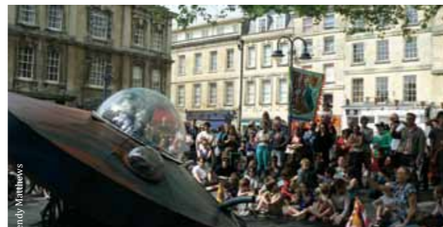
Bath Fringe Festival: Dot Comedy at Bedlam Fair