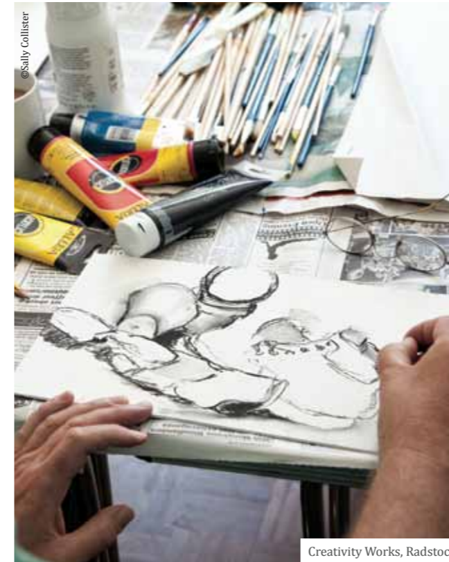
Creativity Works, Radstock