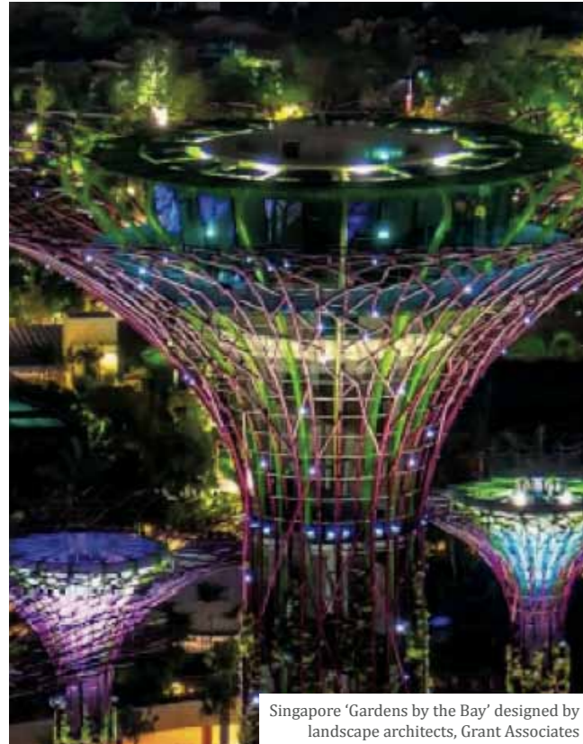
Singapore 'Gardens by the Bay' designed by landscape architects, Grant Associates