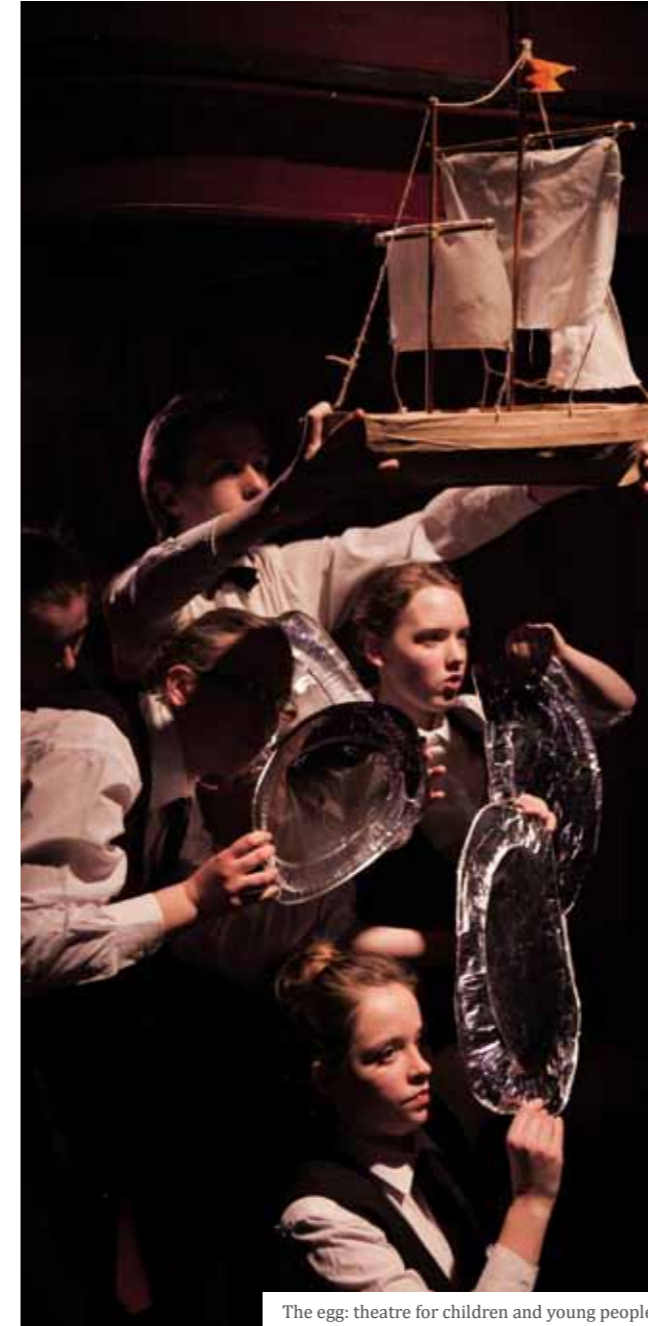
The egg: theatre for children and young people