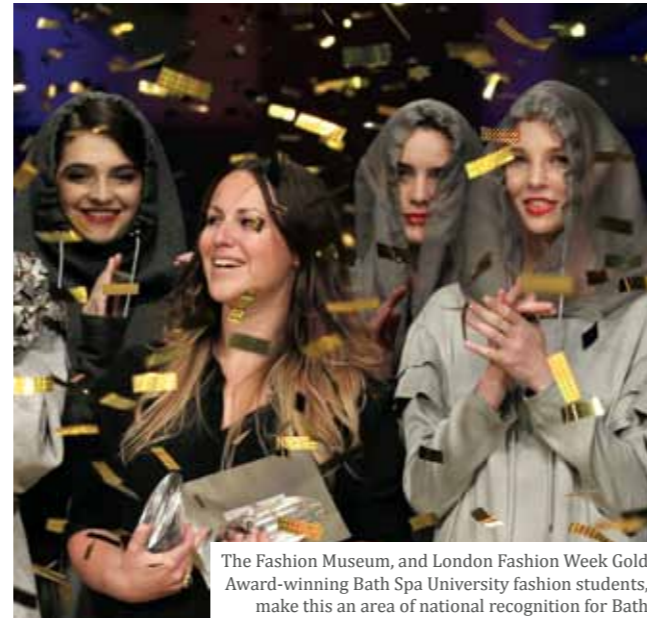
The Fashion Museum, and London Fashion Week Gold Award-winning Bath Spa University fashion students, make this an area of national recognition for Bath

✦ Work differently, smarter, cross-sector, public and private: raise our ambitions through a shared commitment to excellence for all and the creation of a city ready for future challenges and opportunities.