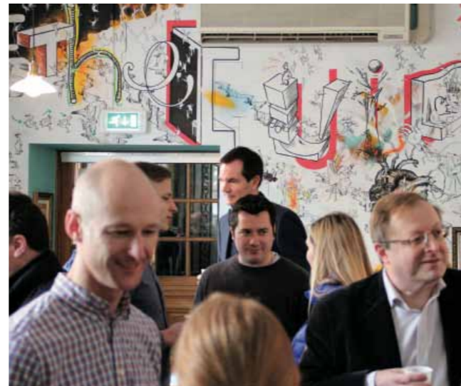
The Guild Co-working Hub: creative-tech workspace in central Bath

Research also demonstrates that taking part in arts activities has a positive impact on dementia and depression, and improves the likelihood of students from low-income families getting a university degree. The intrinsic value of culture and creative learning is at the heart of B&NES’ Child Friendly City initiative.