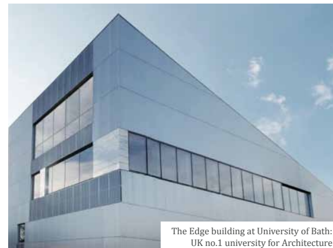
The Edge building at University of Bath: UK no.1 university for Architecture

✦ Increase availability and diversity of workspace hubs for creative and cultural industries along the lines of Bath Guild Co-working Hub, Bath Artists Studio, The Makery, and Glove Factory, also for satellite hubs in neighbouring market towns.