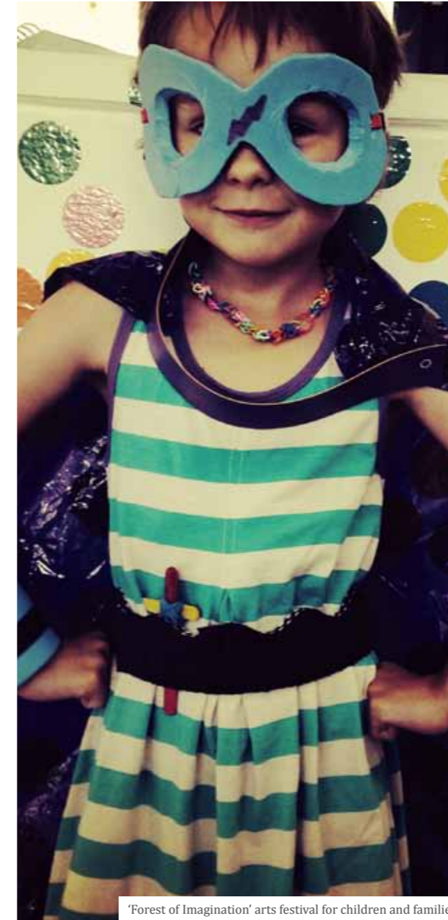
'Forest of Imagination' arts festival for children and families

✦ Expand our audience base beyond B&NES: to the West of England, national, and international audiences.