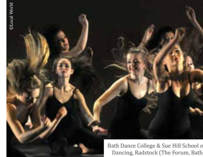
Bath Dance College & Sue Hill School of Dancing, Radstock (The Forum, Bath)