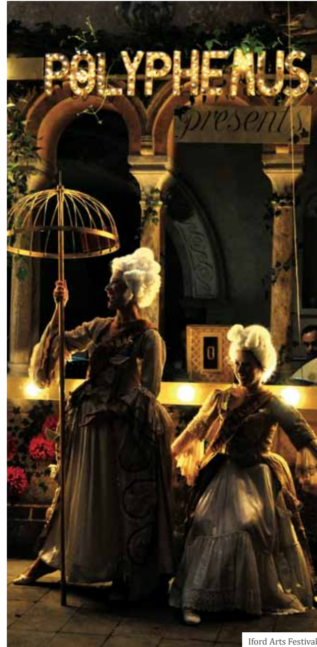
Iford Arts Festival