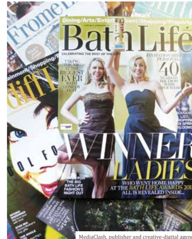
MediaClash, publisher and creative-digital agency