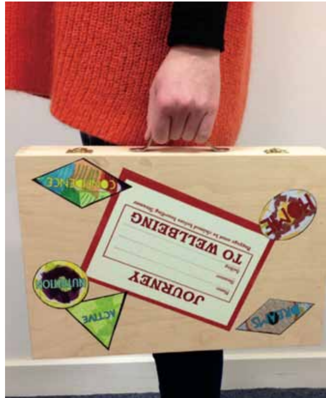
Creativity Works: 'Exemplary work in socially engaged arts & delivery of creative projects that make a real difference to people's lives' (Arts Council England)