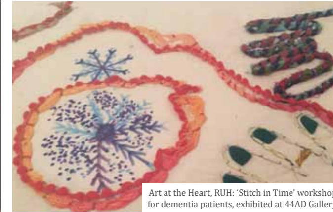
Art at the Heart, RUH: ‘Stitch in Time’ workshop for dementia patients, exhibited at 44AD Gallery