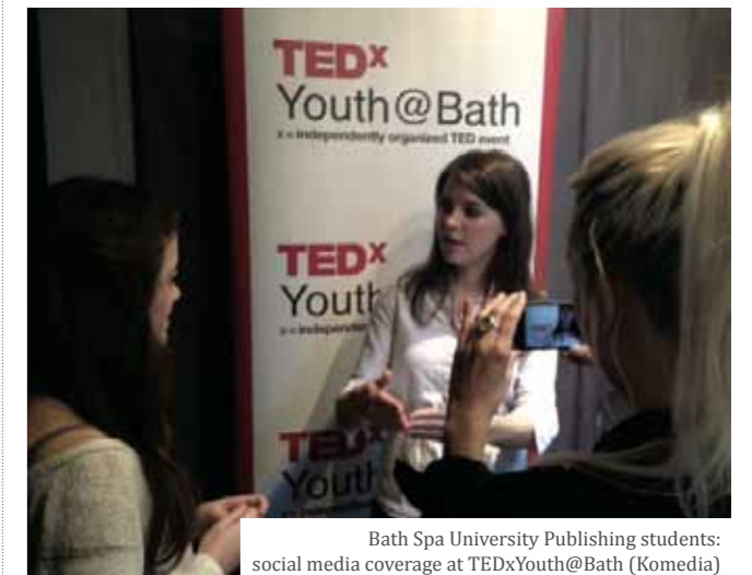
Bath Spa University Publishing students: social media coverage at TEDxYouth@Bath (Komedija)