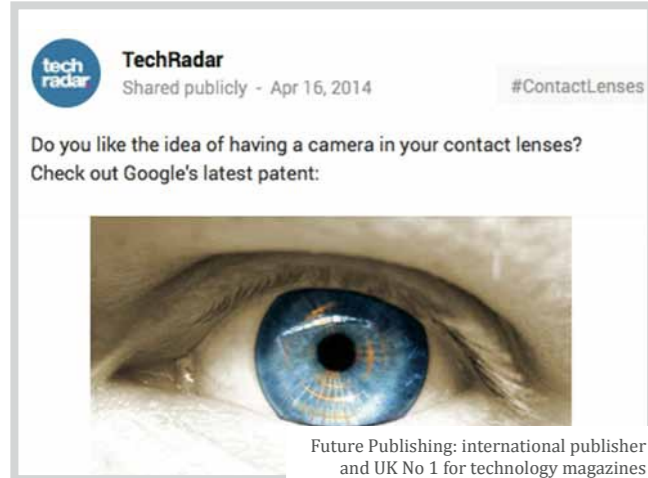
Future Publishing: international publisher and UK No 1 for technology magazines