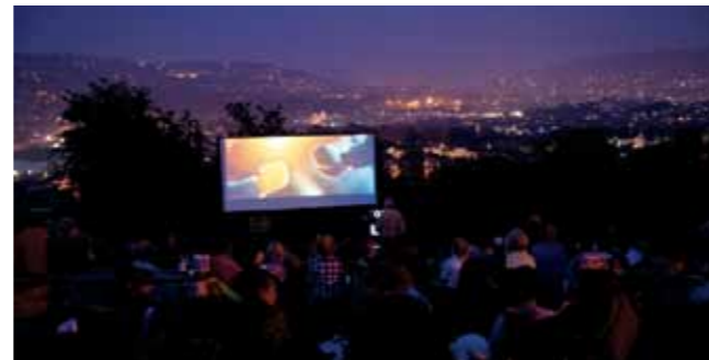
Bath Film Festival (Bath City Farm, Twerton)