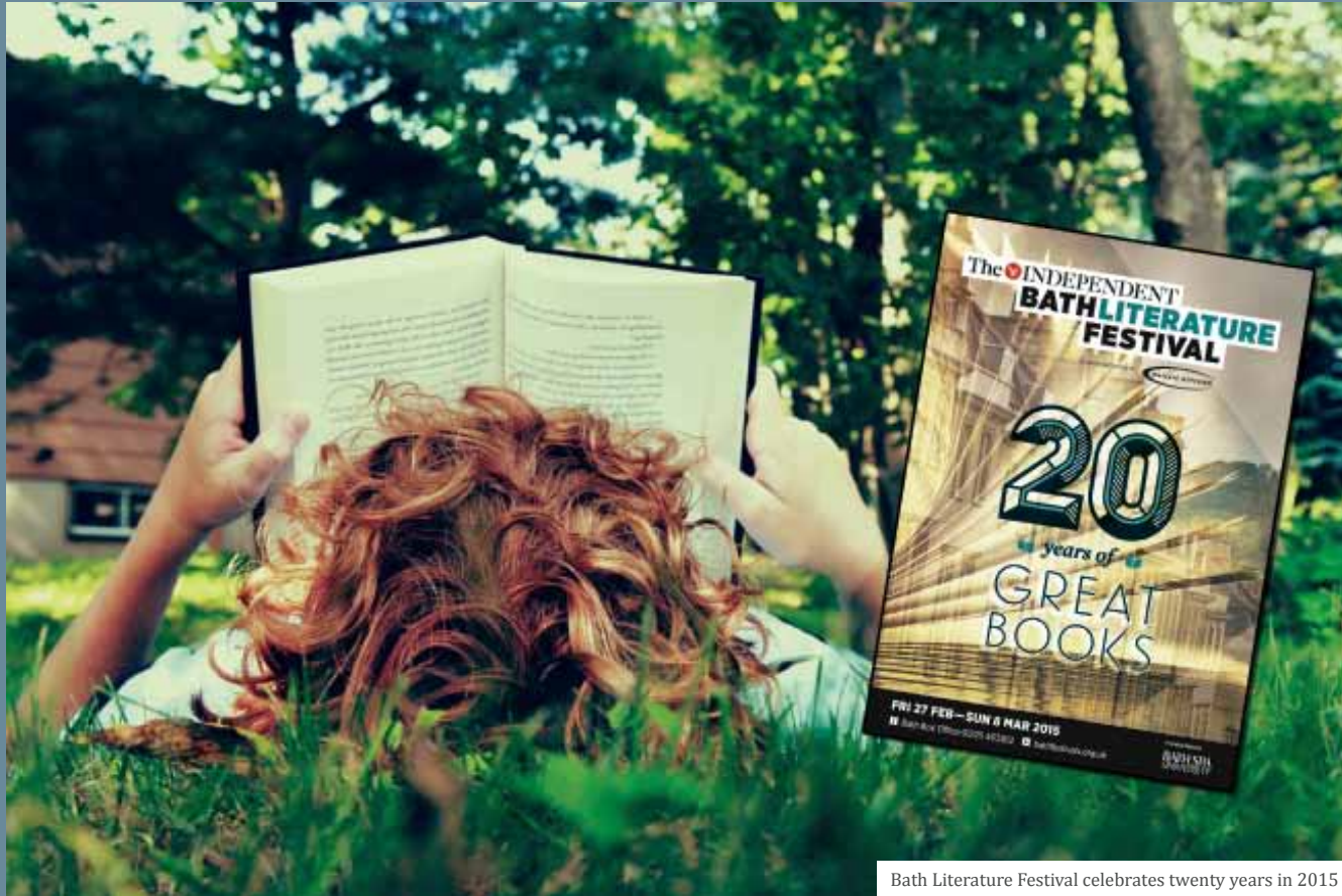
Bath Literature Festival celebrates twenty years in 2015